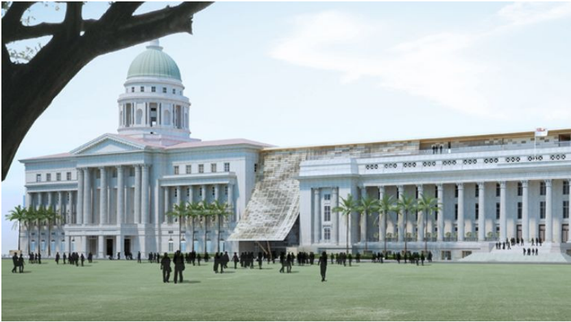
National Gallery Singapore

As agreed during the CiMAM Board Meeting in Tokyo, the 2014 – 2016 Board took charge of the selection process for the 2017 Annual Conference venue to support the incoming Board, after the 2016 Board election. An open call to all members (individual & institutional) was launched in May 2015. Four candidates submitted their bid: Singapore, Luxemburg, Stockholm and Los Angeles. As a result of the online vote, Singapore was the candidate receiving more votes among the members of the current board. Therefore, the 2017 Annual Conference will be held in Singapore, hosted by the National Gallery Singapore.