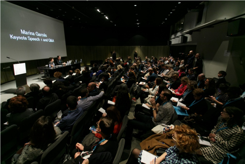
Museu d'Art Contemporani de Barcelona (MACBA)

After 15 years, CÍMAM returned to Barcelona where the Annual Conference took place in 2001. Titled The Museum and Its Responsibilities , the conference reached capacity with attendance by 230 museum professionals from 60 different countries in Barcelona.